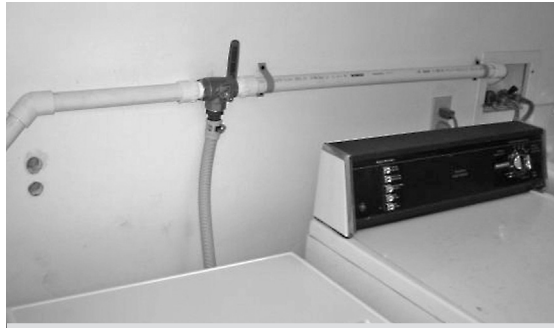
LAUNDRY GREYWATER DISPOSAL SYSTEMS (LGDS)

Greywater is untreated washwater that has not come into contact with toilet waste. It can include washwater from bathtubs, showers, bathroom washbasins, clothes washing machines and laundry tubs but does not include washwater from kitchen sinks, dishwashers or toilets.