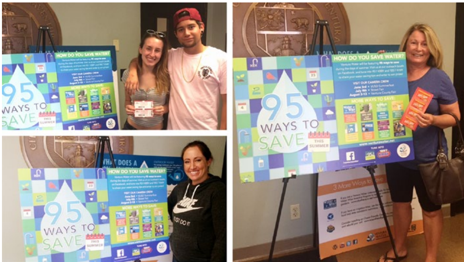
95 Ways to Save winners