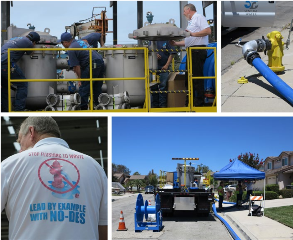
See the General Manager Column

truck circulates the water, filters it and puts it back into the system.