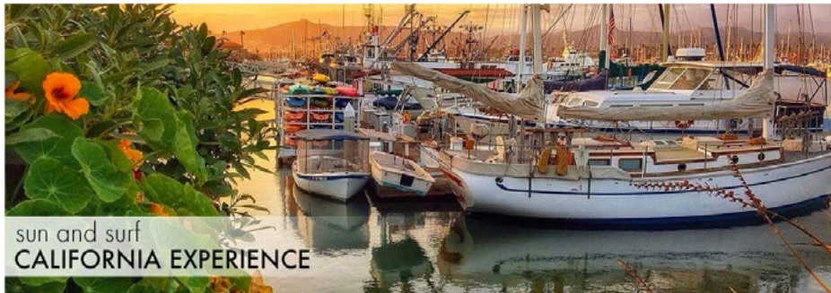
sun and surf CALIFORNIA EXPERIENCE