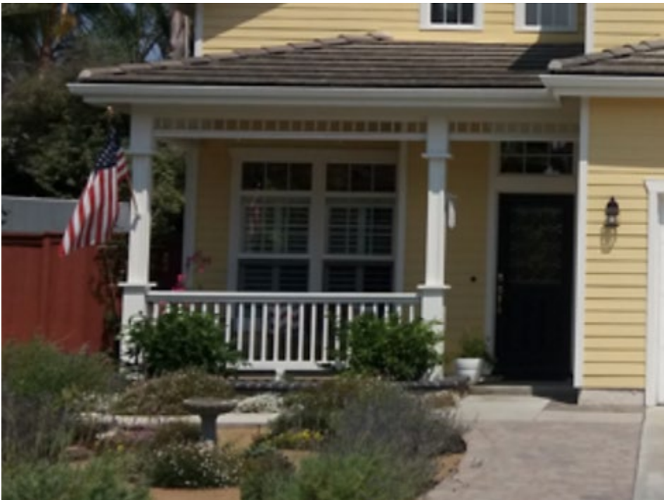
Waterwise Incentive program: Roland Barrio - Car wash winner