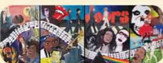
Buena High School