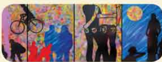
Ventura County Rainbow Alliance