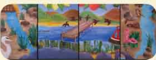
Cabrillo Middle School