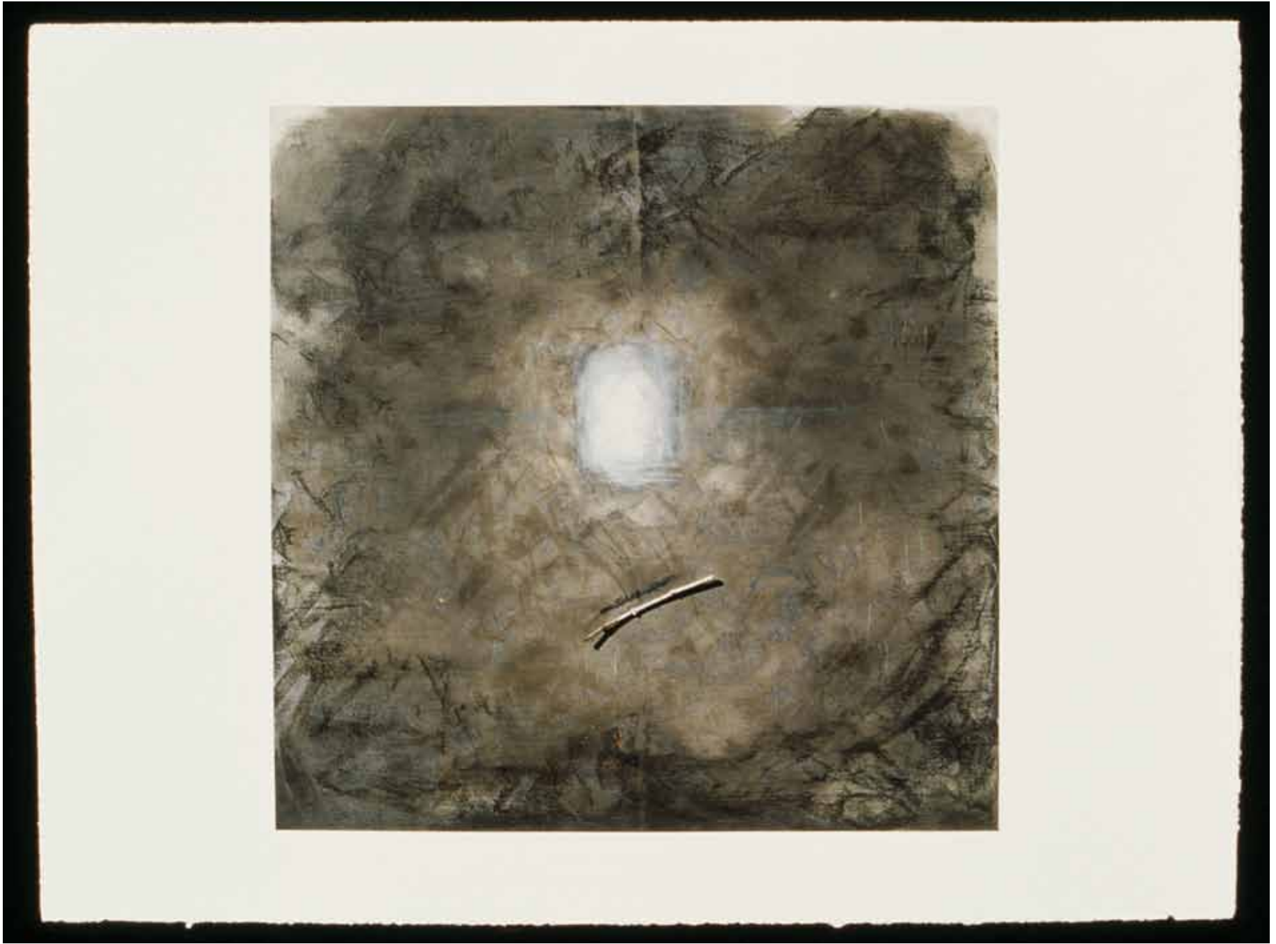
Migration #8 , 1996, mixed media on paper, Debra McKillop