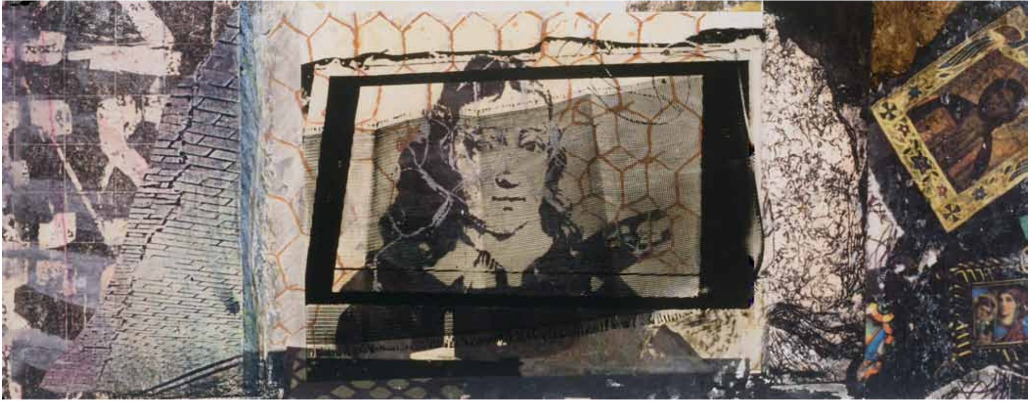
Filtered Vision , 1999, print on paper, Alberta Fins